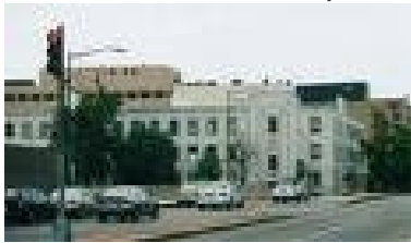
CCNV shelter & WildTech/CCNV

Homelessness is a huge issue across our nation. It is often perceived that drug abuse or behavioral issues are the leading causes of homelessness, yet unemployment is by far the